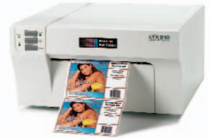
LTX810 Color Label Printer