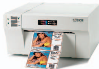
LTX810 Color Label Printer

Until now, in-house color label printers were prohibitively expensive. But now, you can produce stunning, full-color labels for a fraction of the cost of other color label printers. Better yet, the LTX810's print resolution is far higher than thermal transfer or other inkjet color printers. With the LTX810, you're getting the best value and the best output quality!