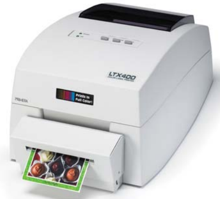
Printer shown is with optional Cutter (93-74263)