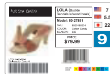
Product Identification Using Pictures