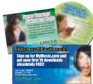
Customized Promotional Messages